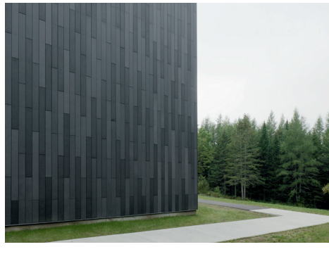
öko skin 147 mm, anthracite, vertical installation (1/3 shifted). screwed on aluminium substructure