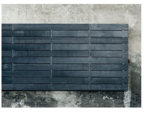
Coming soon! öko skin 147 mm, anthracite vintage, horizontal installation (1/2 shifted), glued on aluminum substructure