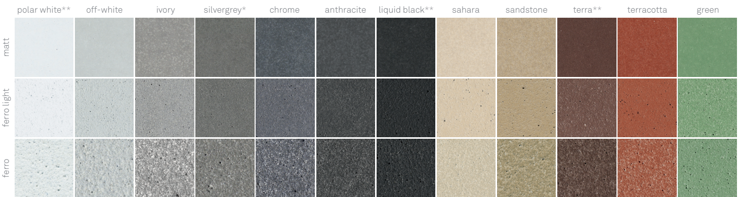
* Discounted color ** Premium colors

ferro, ferro light and matt which create a naturally varied and vivid surface. The play of colors within a certain color shade is intentional and enhances the character of concrete.