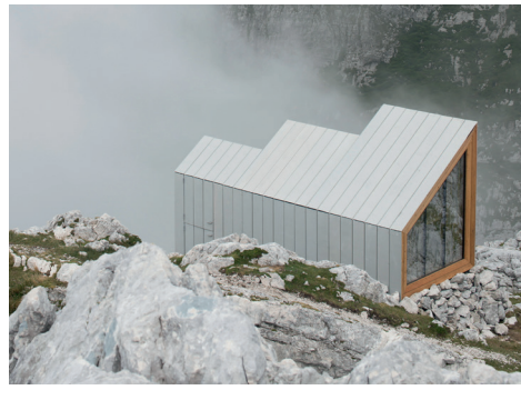
öko skin flex 147 mm, silvergrey, vertical installation, screwed on wooden substructure