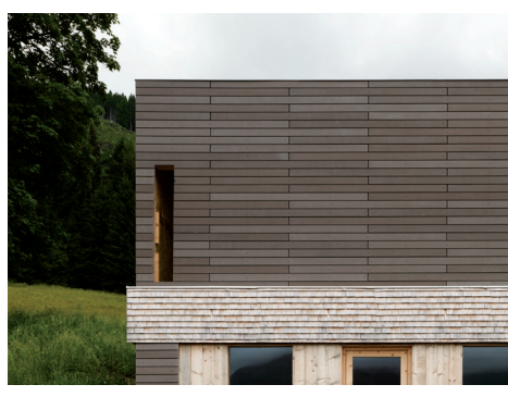
öko skin flex 125 mm, terra.horizontal installation (1/2 shifted) screwed on wooden substructure